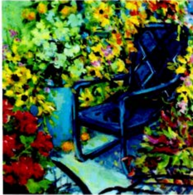
by Sandra Baggette

Monday thru Friday 9 am - 12 Noon Rain or Shine It's FREE!