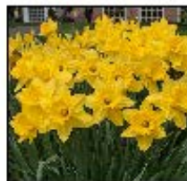
Gigantic Star 10 bulbs $15

Big, strong, early perennial. It's what you could call a meat-and-potatoes daffodil. It's durable and grows well in the South.