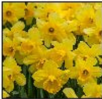
Carlton 10 bulbs $10

A two-tone yellow daffodil with a strong perennial nature. Soft yellow petals encircle a large, frilly, golden yellow cup. It is a splendid multiplier that does well in the South.