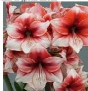
Temptation White w/diffuse raspberry to crimson splashes on upper petals/ petal edges & a dark scarlet-red starburst.