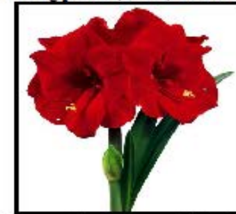
Merry Christmas (Single)

This Papilio-type is flushed pale green with burgundy striations. (18cm; 3-4" flower, 12-14" high)