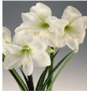
Christmas Gift Glistening white with a luminous green center.