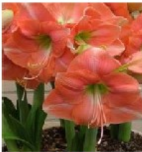
Rosalie Salmon-orange flushed water-Melon w/white highlights.