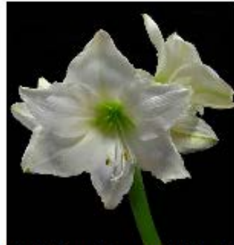
Wedding Dance (Single)

Shades of neyron-rose w/white highlights, small white starburst & a green eye. (24cm; 14-18" high)