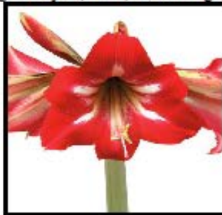
Hot Lips (Miniature)

Light to dark salmon-pink with white striations with layers of dancing petals. (24 cm; 14-16" high)