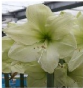
Luna Substantive flower petals of greenish-yellow. It pales to a creamy-yellow as it matures.