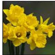
Obvallaris 10 bulbs $10

Obvallaris is a cute little 10" golden trumpet that blooms early and lasts a long time. It looks like a familiar yellow daffodil on a reduced scale, so it's great where space is tight. Grows well in the north and as far south as Tallahassee.