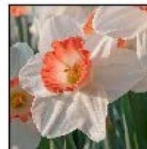
Pink charm 10 bulbs $15

White flowers with wide cups that look as though they were dipped in apricot nectar. It's a great naturalizer and is very adaptable. Grows well everywhere.