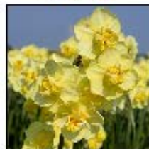
Yellow cheerfulness 10 bulbs $10

Each stem bears clusters of 3-4 double, yellow, very fragrant blooms. This heirloom flowers late in the daffodil season.