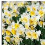
Ice Follies 10 bulbs $10

Very large, silvery white flowers with a wide lemon-yellow cup that turns white as the flower matures. It is one of the strongest growing daffodils ever and great for naturalizing. North and South.