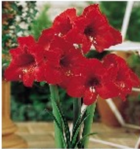
Floris Hecker This exquisitely formed beauty is rich velvety-red.

Individual Bulbs - $15/each -- These quality bulbs are 30/32 cm. unless noted (*).