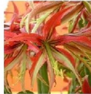
Cybister La Paz (*24 cm) Spidery petals are dark coral, greenish-white edged, darker mid-veins & green throat.