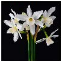
Thalia 10 bulbs $10

Nodding white flowers, usually 2-3 per stem, with narrow petals and a delicate cup. They have a light, feathery quality. Excellent for massing at the edge of woods or among shrubs.